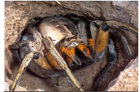
Spider waiting to jump on its prey.

Not all spiders make webs, but they all make silk. Many hunt on the ground, like the jumping spiders, and some even build trap-doors under ground so they can hide and wait for their prey (food).