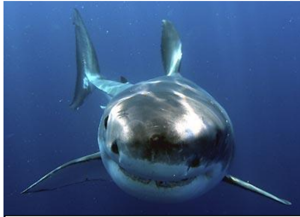
Great white shark.

Sharks have rough skin and they cannot fold their fins. Sharks have strong jaws (mouths) and many have sharp teeth, but some have flat grinding teeth. Sharks have a fantastic sense of smell and can sniff out food from huge distances. There are about 350 types of shark; they include some of the largest fish in the world.