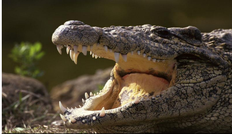
Crocodile grazing in the sun.

Crocodiles and alligators belong to a group of reptiles called crocodylians. These fierce carnivores (meat-eating animals) have not changed much for millions of years. Today, there are 14 different types of crocodile, 2 types of alligator and 6 types of caiman.