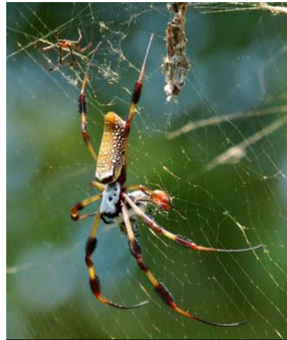
Spider on its web.