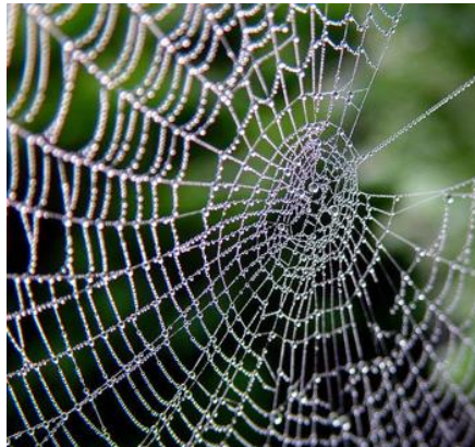
Spider web with rain droplets.